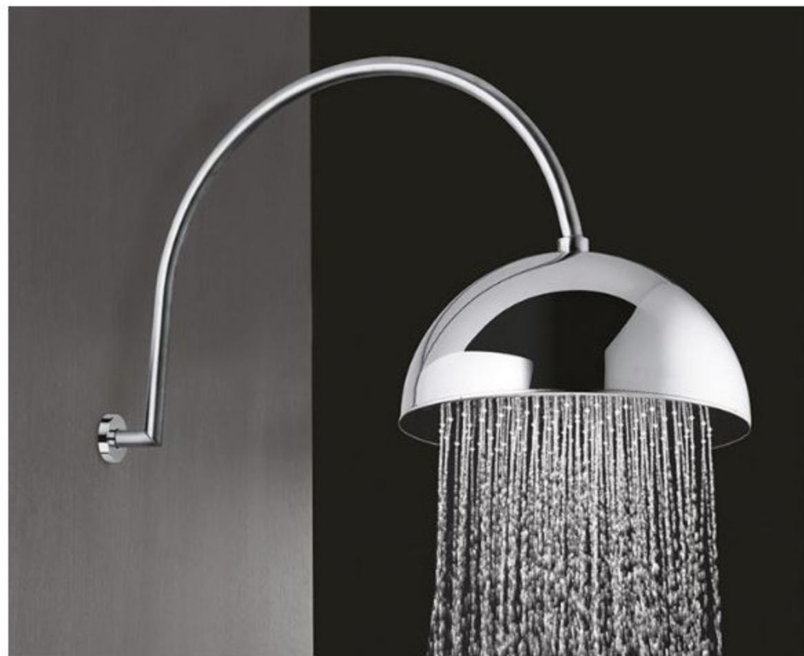
BOLD by Ramon Soler

The shower head BOLD has been designed from a sphere of perfect proportions resulting in a captivating design. Available for two types of installations, with a ceiling arm which holds the shower head providing a unique elegance or from a wall arm for which Ramon Soler® goes further and designs an original arm that follows the curved lines, with a unique balance.