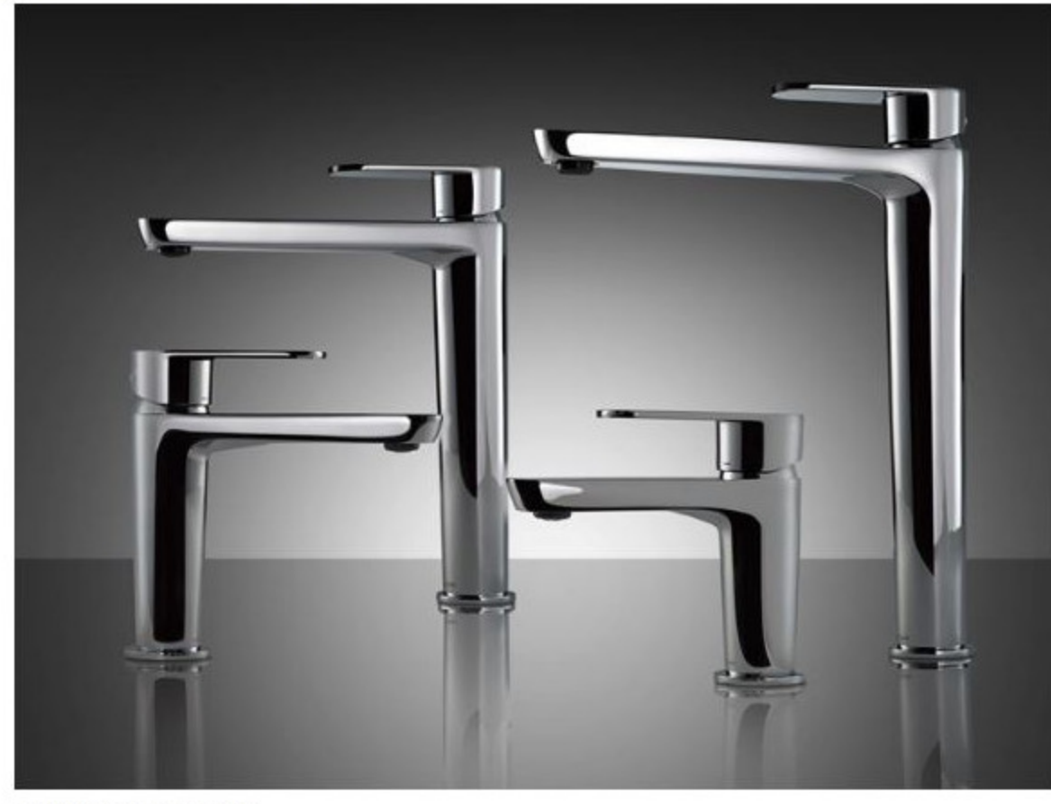
ALEXIA by Ramon Soler

ALEXIA is a collection of slender and inspiring aesthetics designed by Carmen Barasona . The collection fits perfectly with the different needs when it comes to creating a washbasin. It offers a single handle in four sizes XL L M S , perfect for both a traditional sink and a minimalist washbasin. ALEXIA is inspired by conical and ergonomic shapes, paying special attention to every detail of the faucet, thus achieving a delicate effect with a conical spout that just crowned by a handle of smooth lines.