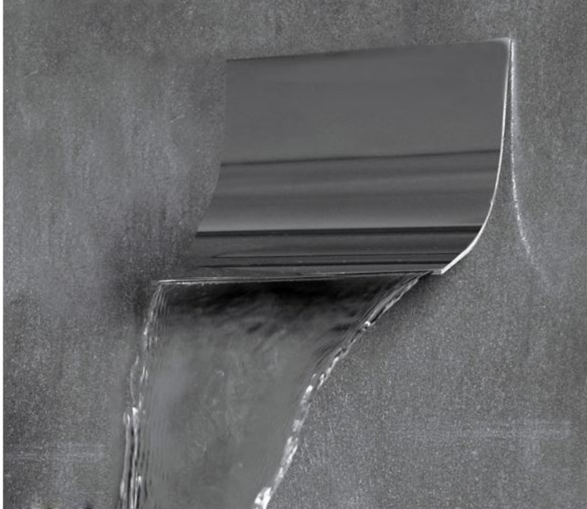
DRAKO by Ramon Soler

Ramon Soler® presents an exclusive spout to be recessed in the wall of the sink, made entirely in stainless steel. Its design is minimalist and very chic, it is a superfine spout that combines perfectly with the single handles of the brand. It is an important innovation for its versatility and its spectacular waterfall, in which the brand combines aesthetics, technology, innovation and quality, offering a revolutionary design for the bathroom, taking a step towards to the concept of wellness.